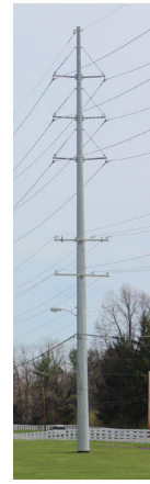
69 KV/138 KV DOUBLE CIRCUIT