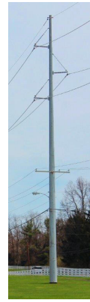
69 KV SINGLE CIRCUIT

* Exact structure, height and right-of-way width may vary